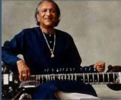
Rock Music Ravi Shanker