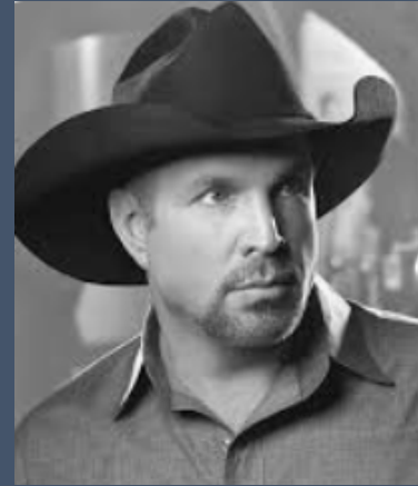
Country Music Garth Brooks